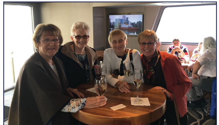
Platinum Adventures members enjoying a cruise on Lake Michigan aboard The Elite last summer.

Seats are limited. Reservations are required.