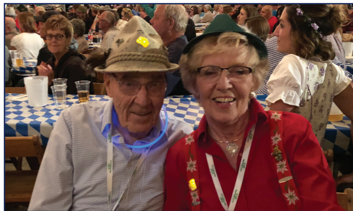
Platinum Adventures members enjoying our extended trip to Frankenmuth Michigan for Oktoberfest!

Price includes: Transportation, a three course gourmet lunch, show and gratuities.